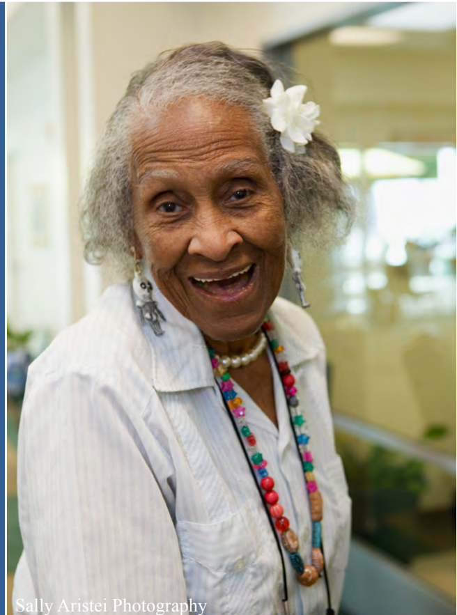
Sally Aristei Photography