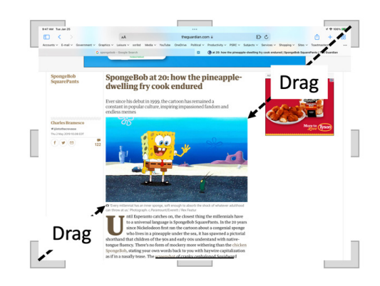
Step 2: Double-tap the thumbnail to zoom out with cropping "handles."