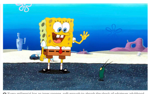
© 'Every millennal has an inner sponge, soft enough to absorb the shock of whatever adulthood can throw at us.' Photograph: c.Paramount/Everett / Rex Featur Step 3: Save the picture. © Paramount/Everett