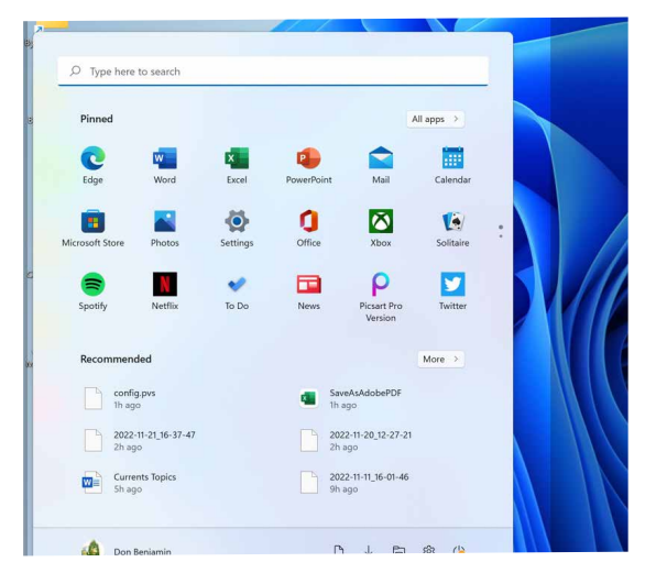
The Windows 11 Start menu is easier to navigate

But Windows 11 isn't simply about "form over function."