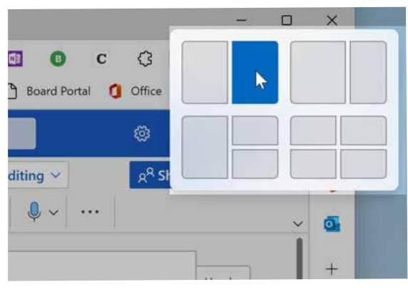
Windows "snap layout" bar lets you quickly arrange multiple windows on your desktop.

In addition to its attractive new look, Microsoft also remodeled many menus and dialog windows to make them easier to navigate and appear more consistent throughout the operating system.